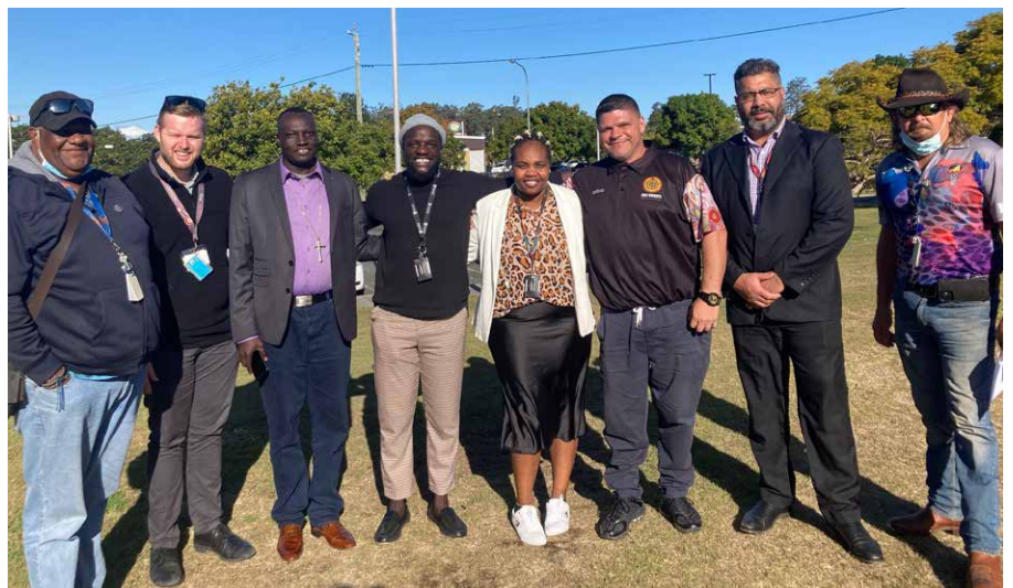
The invited stakeholders, each with an area of expertise in African youth matters.

I was invited by the local magistrate to attend the Richlands Children's Court on 11 July for a stakeholders meeting to discuss insights that would help African youth and their families before the court system. This is a personal initiative by a compassionate judge to find ways to help families caught up in the legal system. Without the connection of family and understanding help, the perpetrators can quickly spiral into a cycle of crime and punishment that will wreck their whole life.