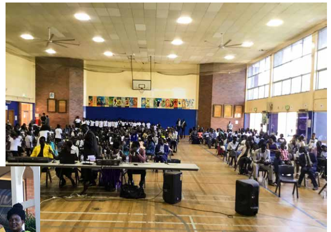
Christmas Day Service at Centenary Heights High School, Toowoomba.